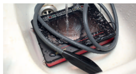
Water resistant when the battery is not attached.