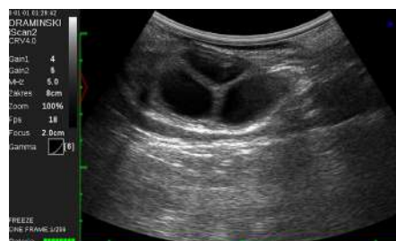
Cow: ovary, image from the convex probe.